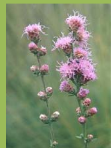
Rough Blazing Star