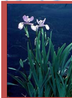
Blue Flag Iris