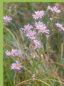
Smooth Blue Aster