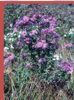
New England Aster